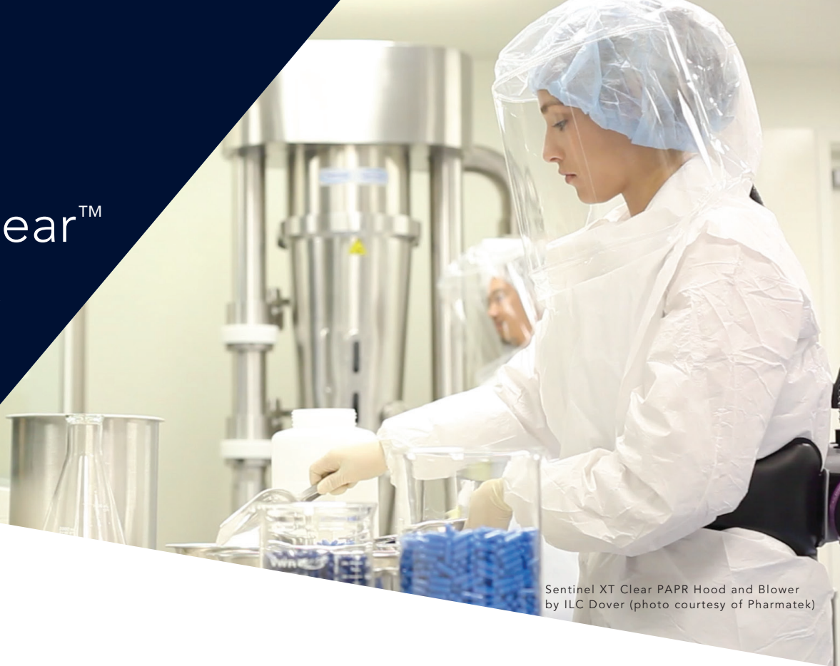
Sentinel XT Clear PAPR Hood and Blower by ILC Dover

SUPERIOR RESPIRATORY PROTECTION FOR A BROAD RANGE OF USERS WORKING IN PHARMACEUTICAL AND BIOPHARMACEUTICAL OPERATIONS.