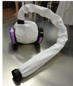
BREATHING TUBE AND BLOWER COVERS

Additional accessories include breathing tubes in 25" and 33" lengths, breathing tube and blower covers, charging cradle/charger and a flow meter.