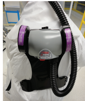
XT BASELINE BLOWER SHOWN WITH OV/AG/HE CARTRIDGES