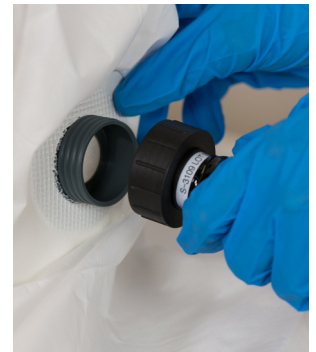
8 SCFM OF AIR SUPPLIED TO THE HOOD IS ABOVE MINIMUM REQUIREMENT