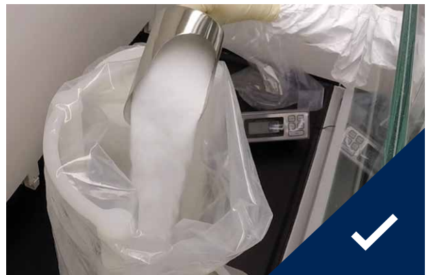
WIDE OPENINGS AND A PROTECTIVE OUTER SKIRT MAKE ILC DOVER'S EZ BIOPAC® CONTAINERS EASY TO FILL, EASY TO SEAL CLEANLY AND EASY TO HANDLE DURING TRANSPORT.