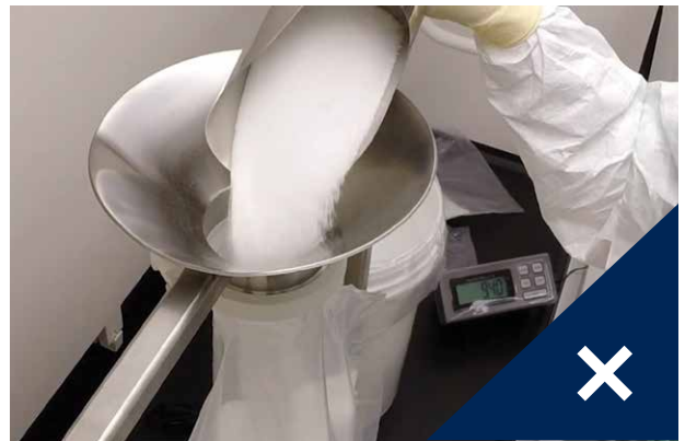
THE NARROW OPENING USED WITH MANY LIQUID-DERIVED CONTAINERS CAN MAKE THEM DIFFICULT TO FILL.

ILC Dover's EZ BioPac® system, for instance, was designed by DoverPac® Containment Systems engineers from scratch, specifically for powder handling in the biopharmaceutical industry. Their focus from the beginning was to get the usability of the system just right. Furthermore, the EZ BioPac system is a true three-dimensional design, allowing for enhanced flow and control of the powder, unlike its two-dimensional competitors.