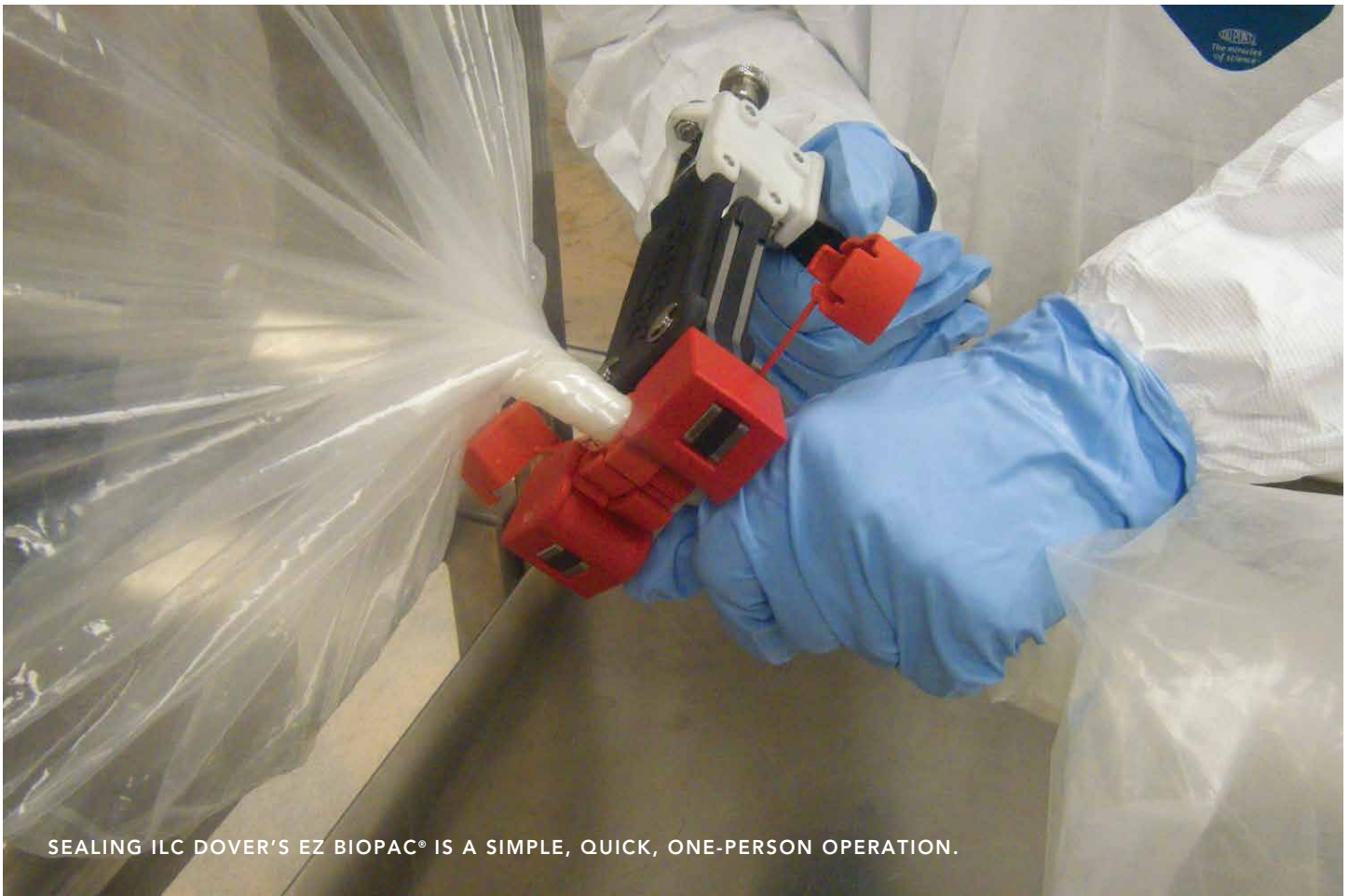
SEALING ILC DOVER'S EZ BIOPAC® IS A SIMPLE, QUICK, ONE-PERSON OPERATION.