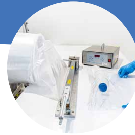
Dual weld / cut heat sealer to contain waste exit