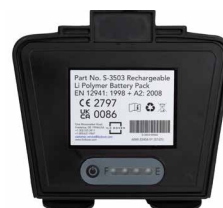
S-3503 LiPO Rechargeable Battery