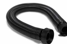
S-3506 19" Expandable Breathing Tube