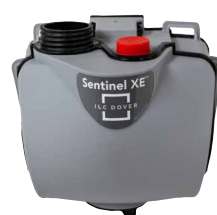
S-3502 Blower Sentinel XE