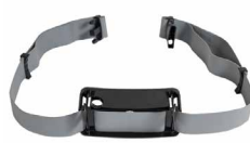
S-4011 Quick-Loc Waist Belt