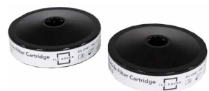
S-4016 HEPA Cartridge