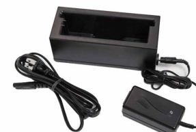
S-4504 LiPO Charging Kit (Charger & Cradle)