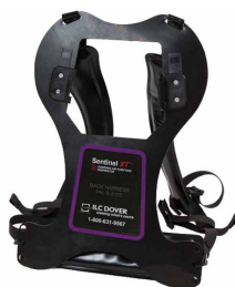
S-3105 Back Harness