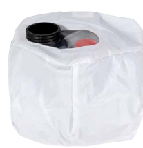
S-3103 Blower Cover