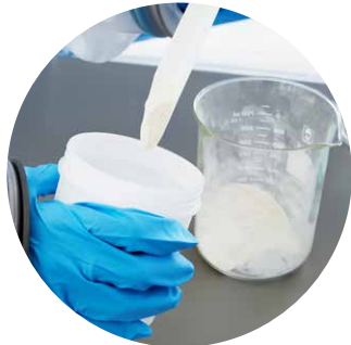
Safe containment of hazardous materials