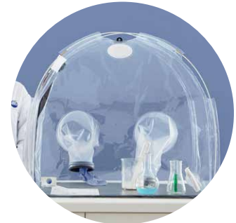
Small footprint means more room for additional laboratory space