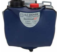
S-3315 Blower Sentinel XT/NI