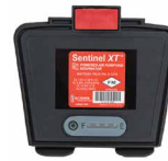
S-3316 Battery Rechargeable LiPO w/ secure latch