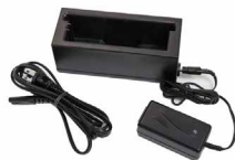
S-3303 LiPO Charging Kit (Charger & Cradle)