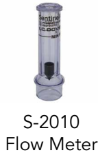
S-2010 Flow Meter