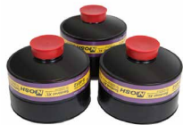
S-4012 OV/AG/HE Filter Cartridge