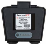
S-3108 LiPO Rechargeable Battery