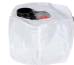
S-3102 Blower Cover