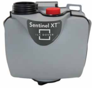
S-3114 Blower Sentinel XT