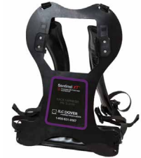
S-3105 Back Harness