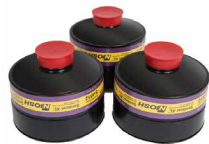
S-4017 A2P3 Cartridge