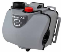
S-3502 Blower Sentinel XE