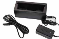
*S-4504 (EU & UK) LiPO Charging Kit (Charger & Cradle)