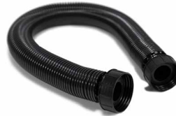
S-3506 Extendable Breathing Tube