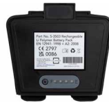
S-3503 LiPO Rechargeable Battery