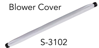
S-3102 Breathing Tube Cover